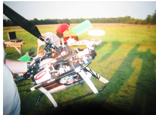
After a crash