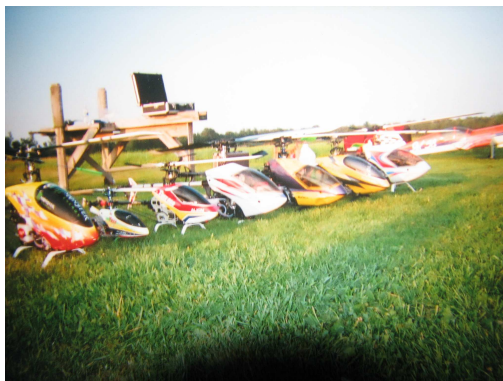
The Fleet of Choppers